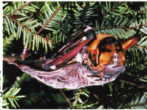
A hoary bat

allowing the bat to breathe. Contact your health department or animal-control authority to make arrangements for rabies testing. If you see a bat in your home and you are sure no human or pet exposure has occurred, confine the bat to a room by closing all doors and windows leading out of the room except those to the outside. The bat will probably leave soon. If not, it can be caught, as described, and released outdoors away from people and pets.