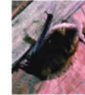
The little brown bat is one of America's most abundant and widespread species. It is often found roosting in attics or barns.

Additional “bat-proofing” can prevent bats from roosting in attics or buildings by covering outside entry points. Observe where the bats exit at dusk and exclude them by loosely hanging clear plastic sheeting or bird netting over these areas. Bats can crawl out and leave, but cannot reenter. After the bats have been excluded, the openings can be permanently sealed. For more information about “bat-proofing” your home, contact Bat Conservation International (see front of brochure).