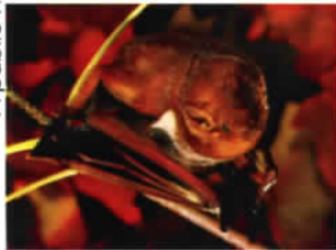
A male red bat