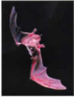
Mexican free-tailed bats are easily recognized by their tails, which extend well beyond the tail membrane. Its long, narrow wings are designed for speed and long-distance travel.

When people think about bats, they often imagine things that are not true. Bats are not blind. They are neither rodents nor birds. They will not suck your blood — and most do not have rabies. Bats play key roles in ecosystems around the globe, from rain forests to deserts, especially by eating insects, including agricultural pests. The best protection we can offer these unique mammals is to learn more about their habits and recognize the value of living safely with them.