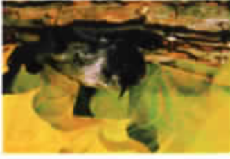
Silver-haired bats roost in tree cavities, especially during migration. Their unique coloration makes them difficult to find. Most recent human rabies deaths have been associated with this species.